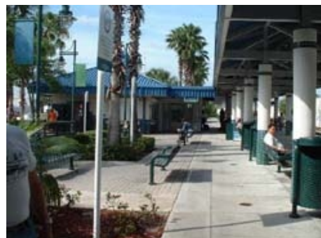
The Tri-Rail Metro interchange station in Miami - see how the people are dressed in March!