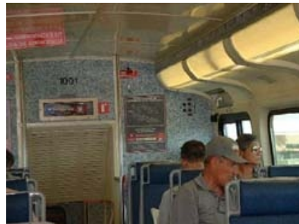
Inside, upper level for the cars