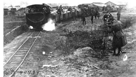
Signal Corps cameraman filming a supply train on the light railway near Dieue-sur-Meuse, November 1918.