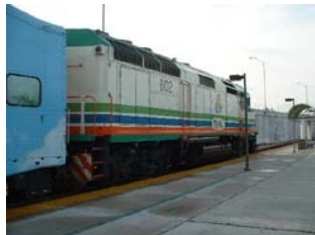
Tri-Rail Power - sorry I am not a diesel spotter.