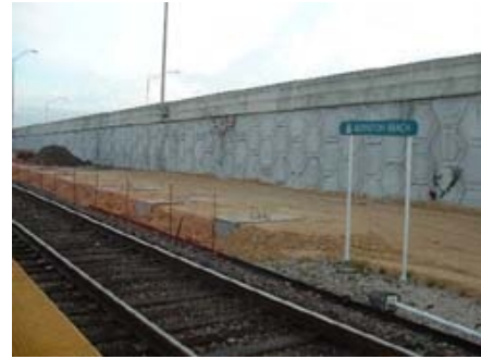
Construction for the 2nd track

CSX uses TriRail track and switches in the Miami yard.