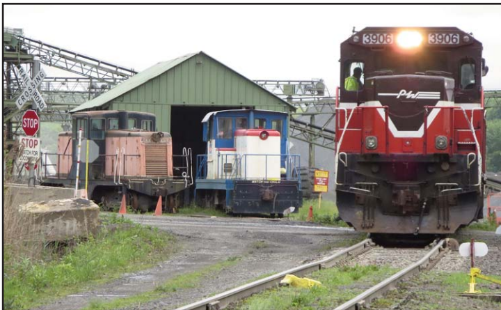
Picking up the stone train at Tilcon quarry in Durham, CT.

Danbury Railway Museum members who live in the Danbury area are cognizant of a visitor to the city several days of the week from April to November. It's the "stone train" of trap rock of up to 40 hoppers, brought into town by the Providence & Worcester Railroad using the tracks of Metro-North and Housatonic Railroads. The trap rock is delivered to the Tilcon asphalt plant near Federal Road in Danbury. It usually arrives very late at night several nights a week (it used to be more frequent when the train used the now-embargoed Maybrook Line from Devon Junction), but the nocturnal movements are still witnessed from time to time by hearty DRM members. The terminating operations are well known, but how many have checked out the origin of the stone train?