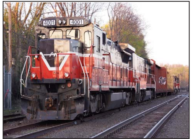
P&W units tied up for the night outside the Station.

Late May and early June the DRM hosted over 500 third-graders, teachers and parents from eight local Danbury elementary schools. The classes visited the DRM after a morning visit at the Danbury Historical Museum. Some classes walked over while others rode in buses, but all arrived in good spirits and filled with enthusiasm. At our Museum, a short safety presentation on "Operation Lifesaver" was followed by a train ride on the Railyard Local, a spin on our turntable or a visit to our Railway Post Office car and then back to the Station. A gift of a pencil and discount coupon rounded out the visit. Some good weather and some not so good didn't dampen the kids' enthusiasm. Our second year cooperating with the Danbury Historical Museum in offering this program seems to be a success.