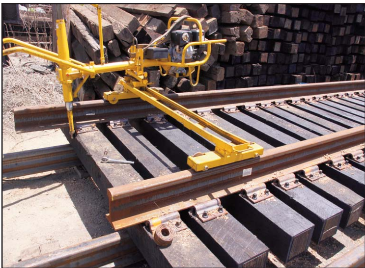
Top left: Composite ties with installed tie plates lined up. Above: A RailWorks crew drills holes into wooden ties. Left: A completed section of panel track using wooden ties with the hole boring and rail gauge machine resting on top.

railroad ties and other discarded materials which are obviously of great use to us. As an aside, the DRM yard has been utilized as a staging site for much of the preparation and assembly work, thus affording us the opportunity to get an education about the ups, downs and pitfalls of trackwork and rail construction in general.