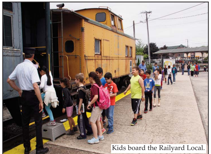
Kids board the Railyard Local.

After an extended period of time that our pedestrian crossing into the yard has been a gravel walkway which easily eroded and had to be periodically maintained by the very busy Metro-North track crews, the crossing has had newly supplied rubber-style road pads installed! These pads will substantially enhance and improve the safety of our private crossing. Thanks and kudos to our Metro-North neighbors!