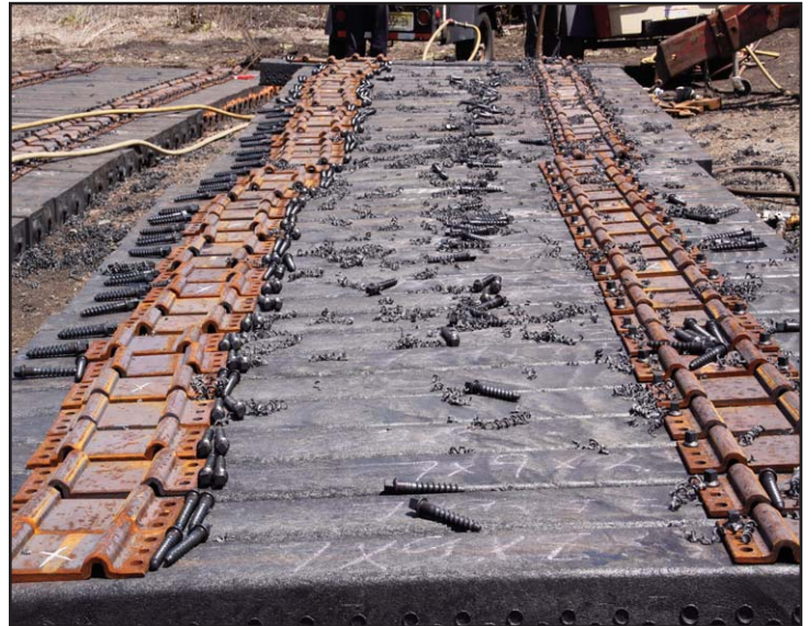
Composite ties and tie plates lined up with holes drilled out.

only some of the frustrations impacting the project. On the construction side of the project, all is not great either. Extraordinary efforts by CDOT, Metro-North, Waters Construction and Rail Construction Corporation (most recently replaced by RailWorks of New Jersey) have also had some issues with the track having the proper gauge, which was possibly caused by the incorporation of newly developed composite (plastic) ties. The solution...yup...back to good-ole' fashioned wood ties. Work continues and it seems that progress is moving right along and ahead of schedule. Everyone involved are busting their rear-ends with long hours and weekend work