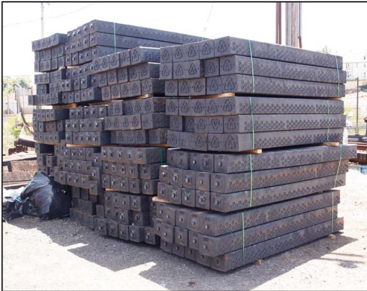
Stacked plastic composite ties.

As many people living around the Danbury area are aware, work on the many Metro-North trackage road crossings are being worked upon. New drainage, ballast, ties, tie plates, clips, etc. are being installed under a multi-million dollar replacement program to rework a marginally functioning signaling system caused by drainage problems affecting correct signal operations and sporadic crossing protection operations. Road crossing closures, which of course aggravates drivers, reduced rail service because track is temporarily removed from service, aggravating commuters, and the need for buses to complete commutes, also disdaining to travelers, are