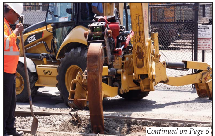
Above: A track crew trying to vacuum gravel out from between the rails, which was so tightly packed into place, a claw attached to a backhoe was needed to loosen it (right).