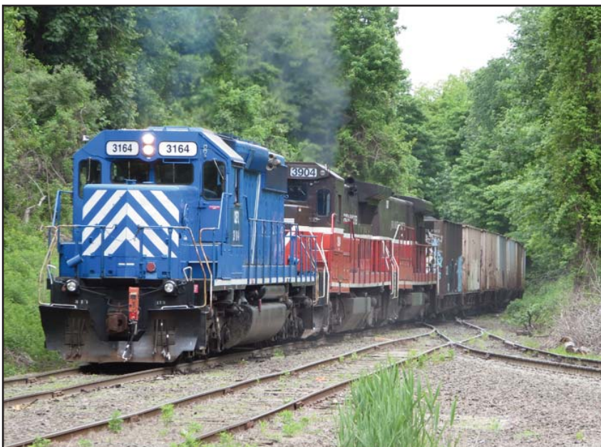
Departing the quarry site in Durham, CT.

the flat car and went into the quarry to pick up the stone train consist. As it slowly came out of the quarry yard, we noticed that a number of the hoppers used were formerly from the Florida East Coast Railway. In about a half an hour from arrival at the quarry, the train was ready to depart for Cedar Hill Yard in New Haven. Later, it