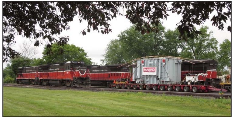
Arriving at an industrial park to pick up a flat car.

The P&W had the flat car "sandwiched" with two units on each end. We paced the train from Middletown to Durham and caught it at five locations on the way to Durham; with ten mph track, it was easy to keep ahead. At Durham, the crew picked up a leased CEFX SD40. The rear two units uncoupled from