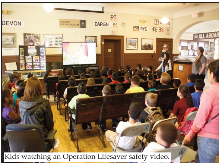
Kids watching an Operation Lifesaver safety video.