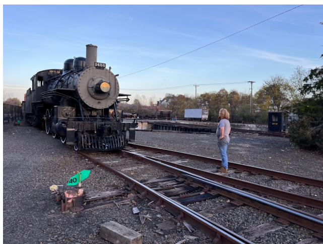
Above: Locomotive 1455 being moved in preparation for Santa trains.