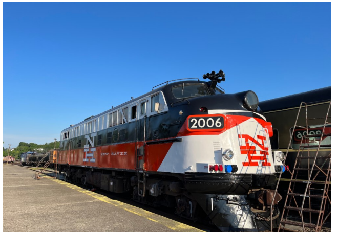
Left: FL-9 2006 undergoing body prep. Right: 2006 towards completion.