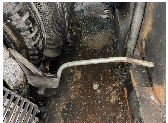
Left: Lit 413 engine room. Right: The museum's new EMD barring tool shown how it will be used.