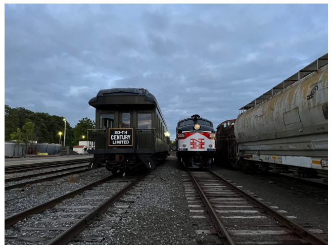
Left: 1399 taking a spin as the first locomotive to ride the turntable since work began. Right: Tonawanda Valley and 2006 while switching.