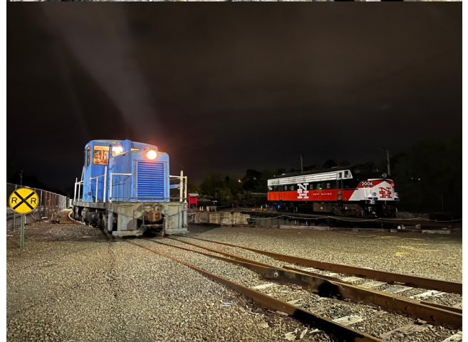
Above Left: 1399 taking a spin as the first locomotive to ride the turntable since work began. Above Right: FL-9 2006 staged on the turntable for the HRA conference.