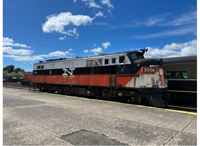
Left: P&W Railroad “outlawed” in Danbury with the stone train. Right: FL-9 2006 prior to painting.