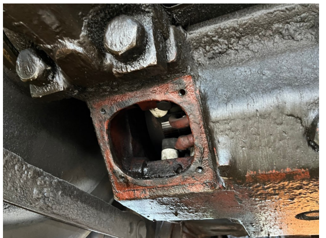
Left: 2006 towards completion. Right: Locomotive 0673 traction motor while inspecting brushes and commutators.