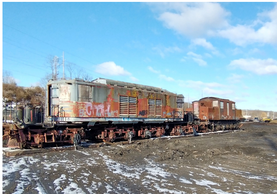
Left: T3-a #278 and S-1 #100 after being relocated 200 feet east on Beacon Island in Glenmont, NY.